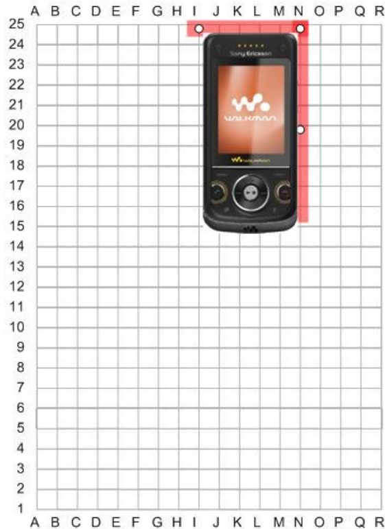
Rohde & Schwarz Shield Box and Coupler (N25)